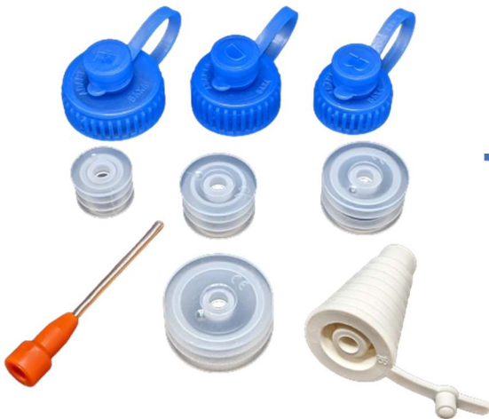
Legacy Pharmacy Accessories